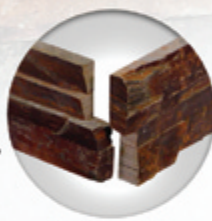
Interlocking Corner Panel

Stone Veneer Panels feature an innovative new process of stone installation. Individually hand selected pieces of natural stone are preassembled and trimmed to size to form a stacked stone panel.