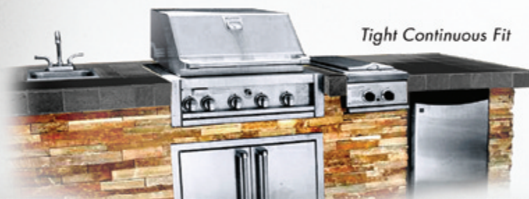
Tight Continuous Fit